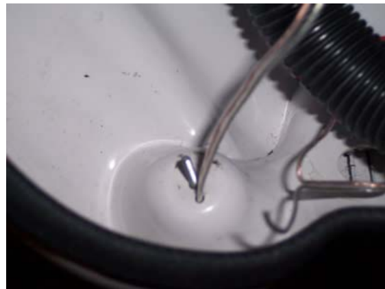
screw and wire threaded through holes