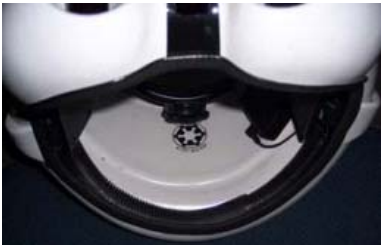
Rear (tubing can be telescoped to allow for resizing)

Note: image does not show easy reach power switches – they should be facing out.