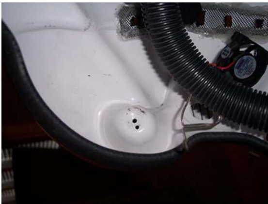
old and new holes inside helmet

If you've not done so already, drill a 1/8th inch anchor hole in the center of each aerator location for the mounting screw. Drill a second hole to the side of the anchor hole for the speaker wires. Thread the speaker wires through the side hole, and install both assemblies to your helmet using the provided nut.